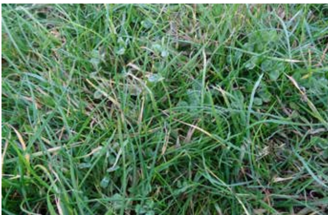
Lax grazing leads to sub-clover becoming shaded by grasses and reduced leaf initiation.

Maximum sub-clover leaf production is achieved by frequent heavy grazing, rather than light grazing and long periods of spelling. Sunlight reaching the crown of the sub-clover plant stimulates leaf production and shading reduces leaf production.