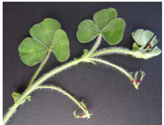
A sub-clover runner with the newest leaf emerging from the end of the runner and flowers at the stem intersection of each leaf.

Flowers and leaves grow from the same position on the runner. The flowers along each runner will be at different stages of maturity, with the oldest flower closest to the crown of the plant and the newest flower at the end of the runner.