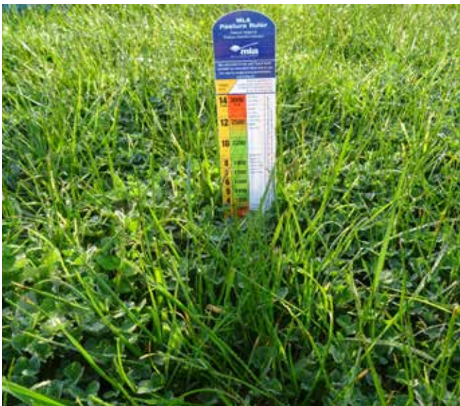
Compromised grazing height to suit both sub-clover and perennial grasses.

Intensive grazing does not need to be repeated each year, as the seed bank can build rapidly in a single season. Continual intensive grazing may also encourage the growth of broadleaf weeds such as capeweed and erodium. These weeds can be successfully controlled using spray grazing.