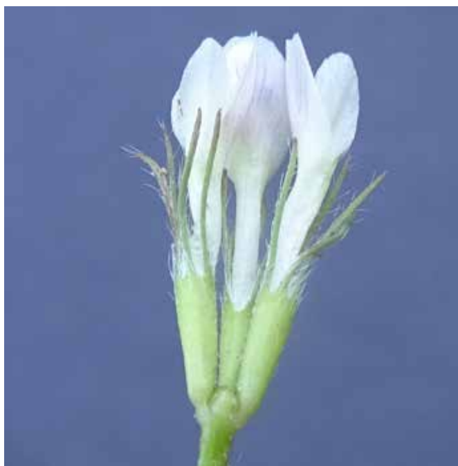
Sub-clover flowers on cultivar Riverina with a green flower tube.