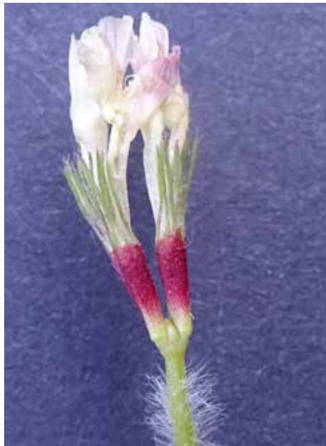
Sub-clover flowers on cultivar Mt Barker showing red pigment on the flower tube.

Sub-clover flowers are easy to observe. They are usually white and have three or four tubular florets. Different cultivars can have different markings, such as red pigmentation.