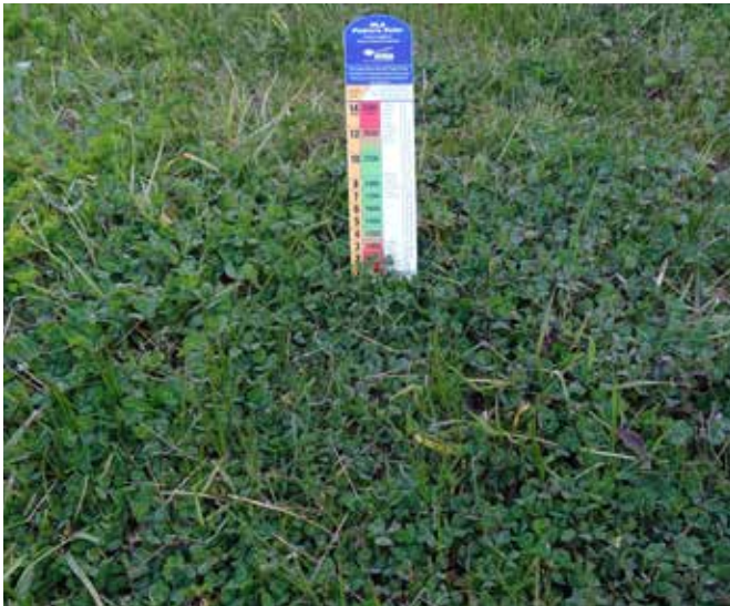
Grazing height to favour sub-clover over perennial grasses.

If more sub-clover is desired, grazing frequently and to 1,000kg DM/ha is necessary.