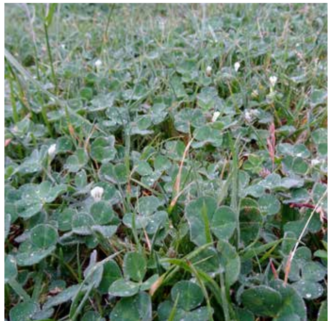
White flowers visible on sub-clover in a pasture.

Regular inspections should be made for pests, especially redlegged earth mites which can damage the flowers without necessarily appearing to do damage to the leaves.