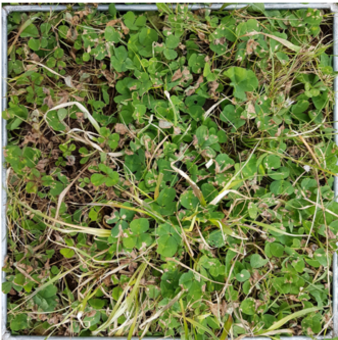
Same plot, pre-treatment in late July (top) and 14 days later (bottom) after the applications of simazine and paraquat