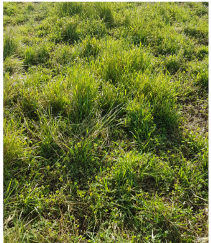
Untreated pasture (left) compared to winter cleaned pasture (right) in mid-November