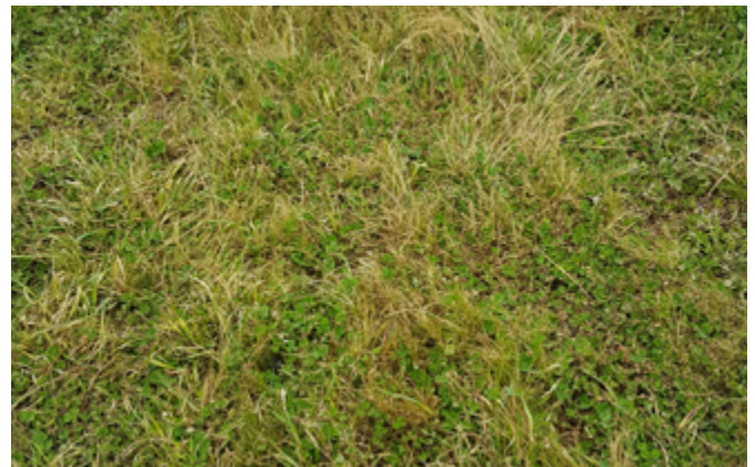
The impact of treatment with simazine and paraquat on sub-clover and grasses before (left) and 10 days following (right)