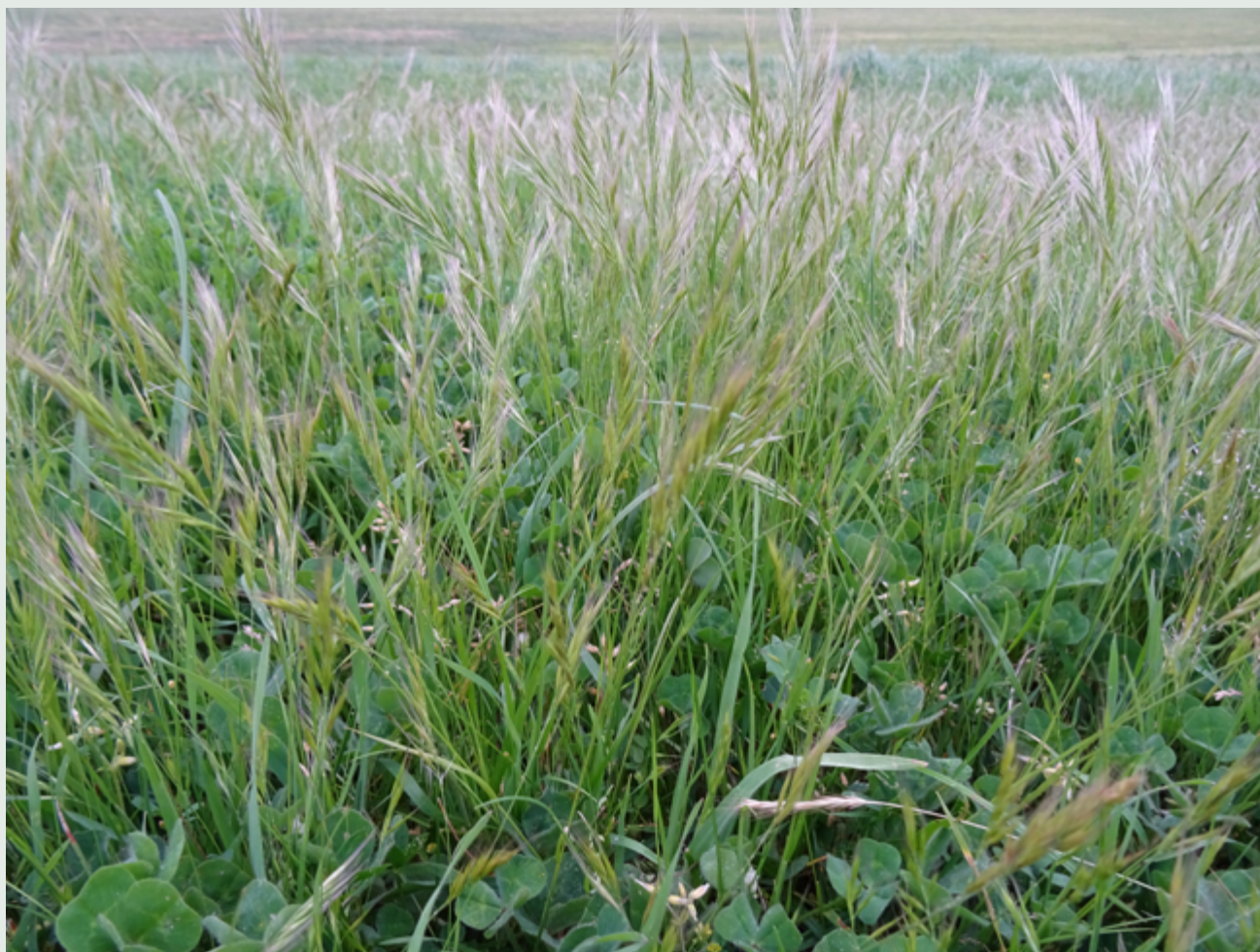
Silver grass setting seed among sub-clover

Different tactics, such as silage, spray-topping or crash grazing at seed head emergence may be required to minimise silver grass seeding in the following seasons.